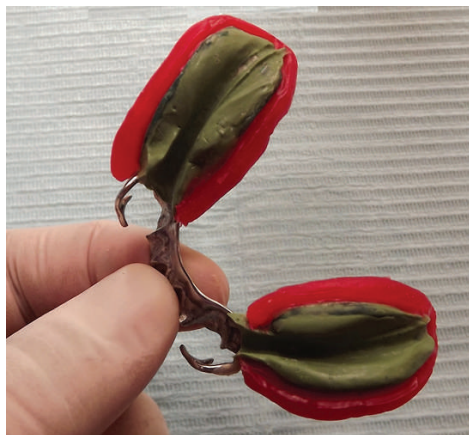
-5- Final impression with beading