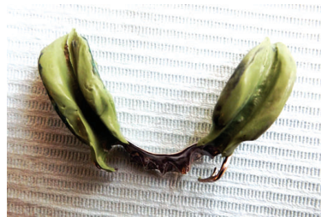
-4- Final Impression with light bodied silicone

moulding was performed using green stick tracing compound (Fig 3). (Metrodent tracing sticks). Tray adhesive (Cauk tray adhesive, Dentsply) was applied over the impression surface of the tray and the final impression was taken using light bodied silicone (3M ESPE Express). During seating of the loaded tray, gentle finger pressure was applied over the areas of the framework which only came in contact with the teeth and not to the tray itself (Fig 4). It was ensured that the framework remained stable and did not move until the impression material was set.