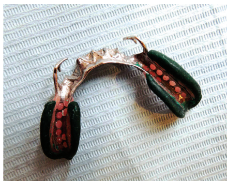
3- Border moulded tray

moulding was performed using green stick tracing compound (Fig 3). (Metrodent tracing sticks). Tray adhesive (Cauk tray adhesive, Dentsply) was applied over the impression surface of the tray and the final impression was taken using light bodied silicone (3M ESPE Express). During seating of the loaded tray, gentle finger pressure was applied over the areas of the framework which only came in contact with the teeth and not to the tray itself (Fig 4). It was ensured that the framework remained stable and did not move until the impression material was set.