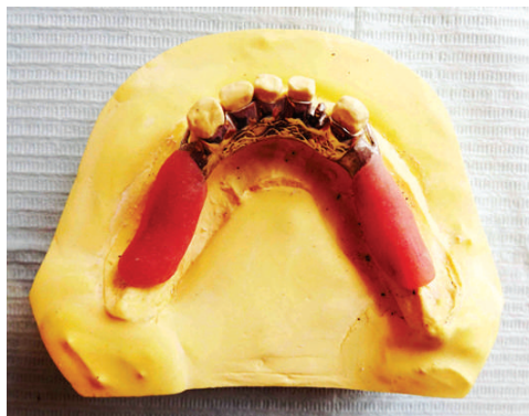
-2- Acrylic resin tray attached to metal framework

The cast metal framework was tried intra-orally for accuracy of fit and once this was done, an acrylic resin custom made trays were fabricated to the mandibular framework (Fig 2.). Border