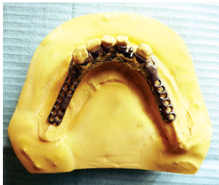
-1- Mandibular metal framework

Mouth preparation was done intraorally and final impressions of both the arches were recorded using medium bodied addition cured silicone (Zhermack Elite Monophase) using custom made trays. Master casts were obtained and design finalized. Investing and casting procedures were performed in the laboratory and the completed framework was checked to ensure that it fits the casts accurately (Fig 1).