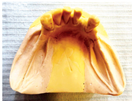
-8- Working Altered Cast

Zinc oxide eugenol paste or low viscosity silicone is usually placed in the customized tray and the framework is placed into the mouth and the impression taken with pressure only on the support elements of the framework resting on teeth. Low viscosity silicone was preferred over zinc oxide eugenol paste in the current